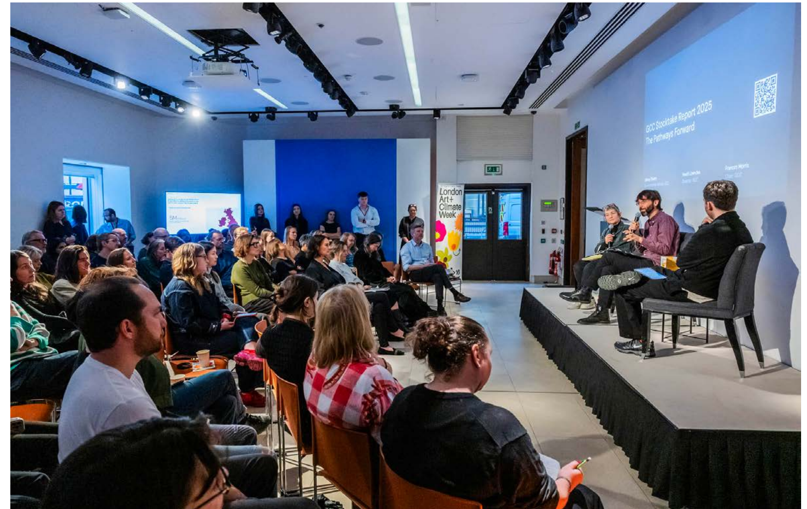
GCC Stocktake Report Preview at Christie's, London. 14 November 2025.