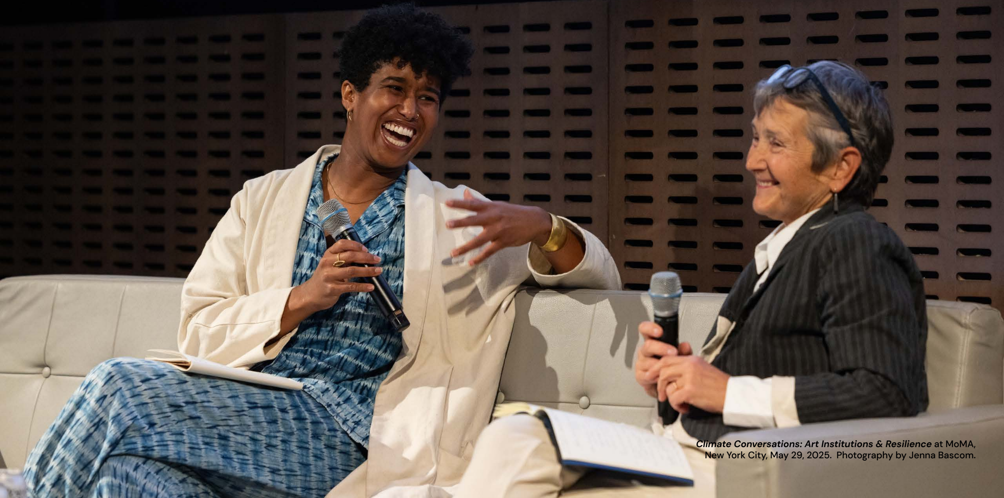
Climate Conversations: Art Institutions & Resilience at MoMA, New York City, May 29, 2025.