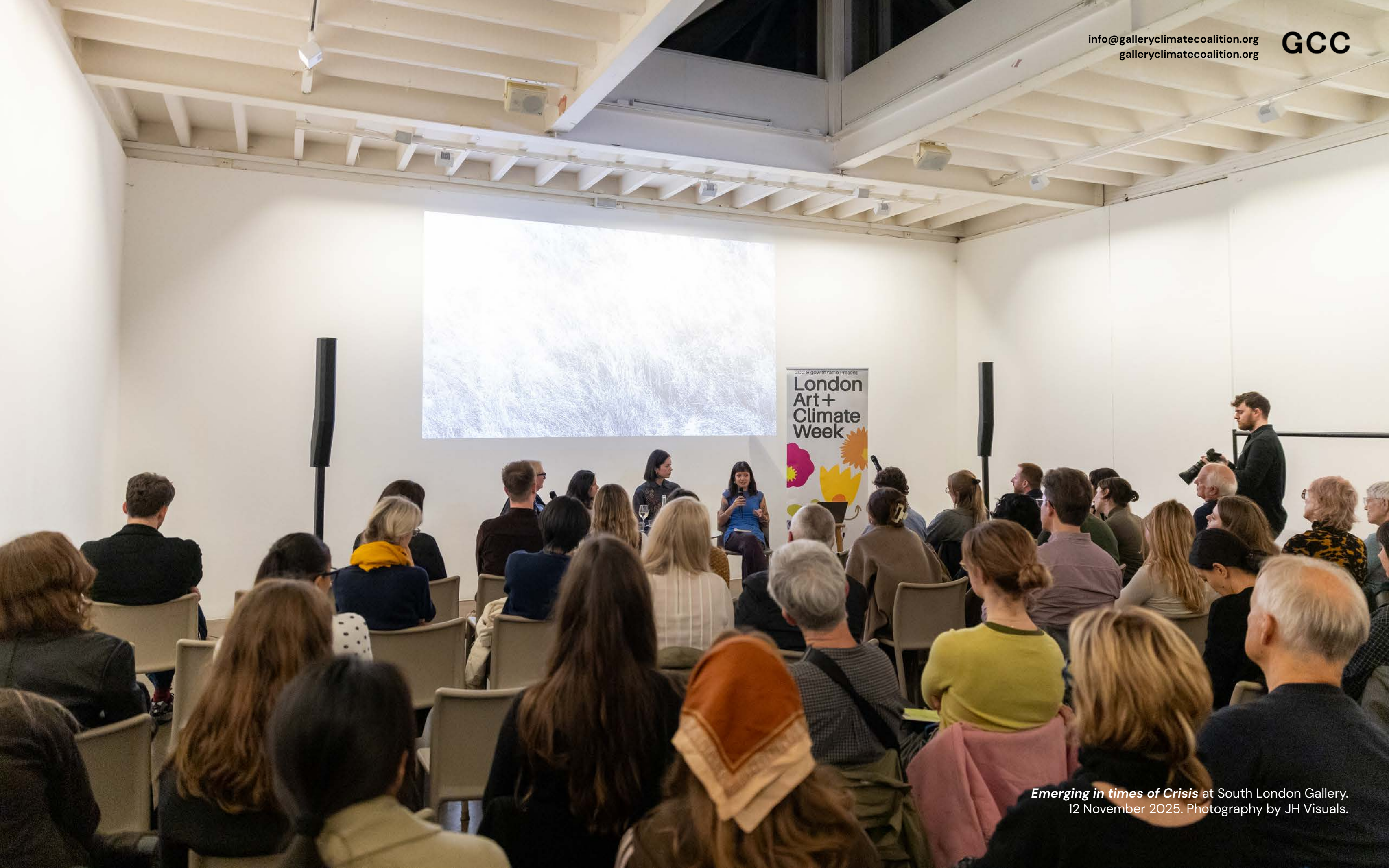
Emerging in times of Crisis at South London Gallery. 12 November 2025.