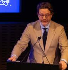
Climate Conversations: Art Institutions & Resilience at MoMA, New York City, May 29, 2025.