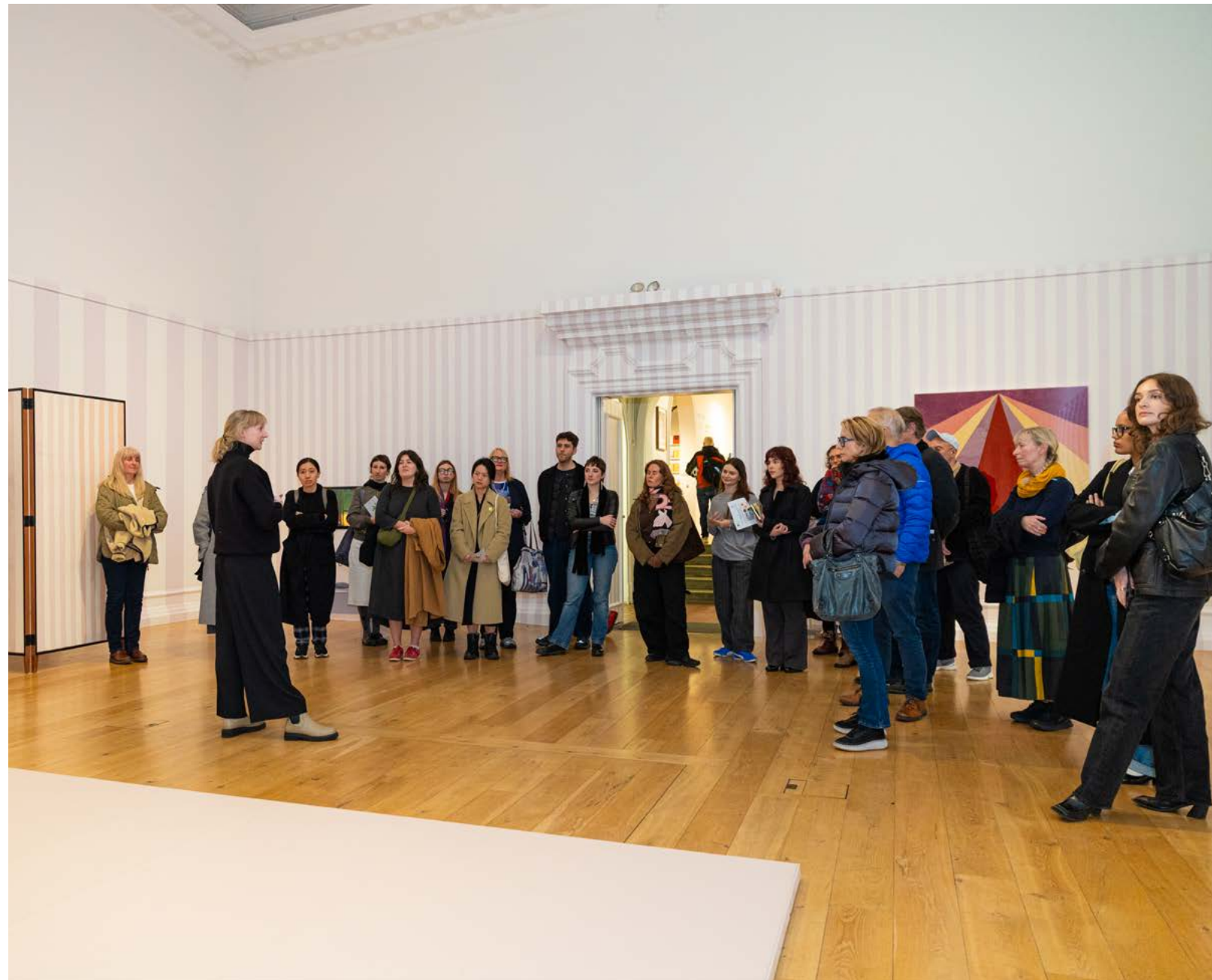
Emerging in times of Crisis at South London Gallery. 12 November 2025.

In November 2025, GCC convened London's leading institutions and contemporary art galleries to launch London Art + Climate Week, a new five-day public programme aligning the visual arts sector with global climate action. More than 25 organisations participated, presenting over 30 free exhibitions and events, marking the first coordinated, sector-wide art and climate initiative of its kind in the UK capital.