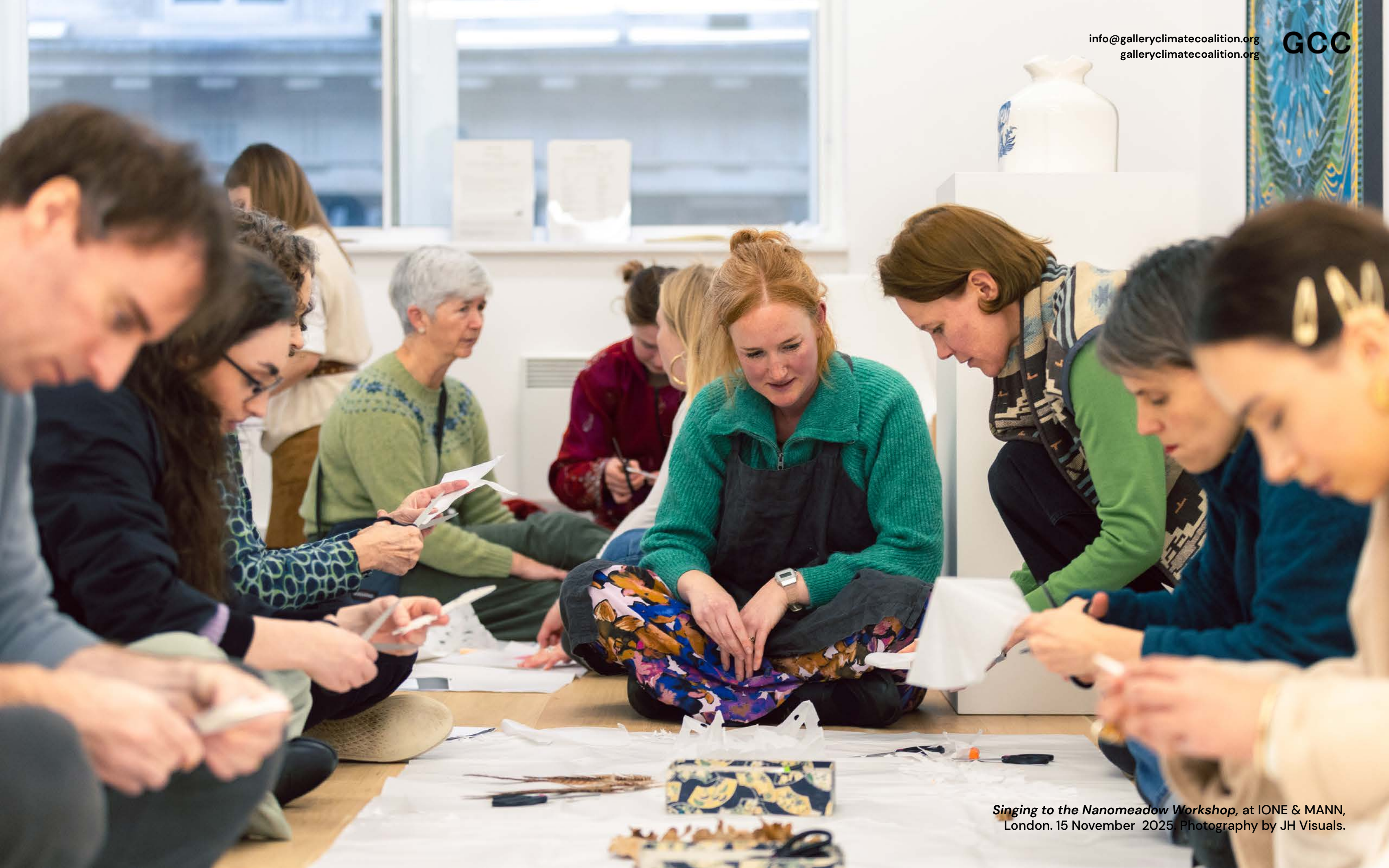
Singing to the Nanomeadow Workshop, at IONE & MANN, London. 15 November 2025.