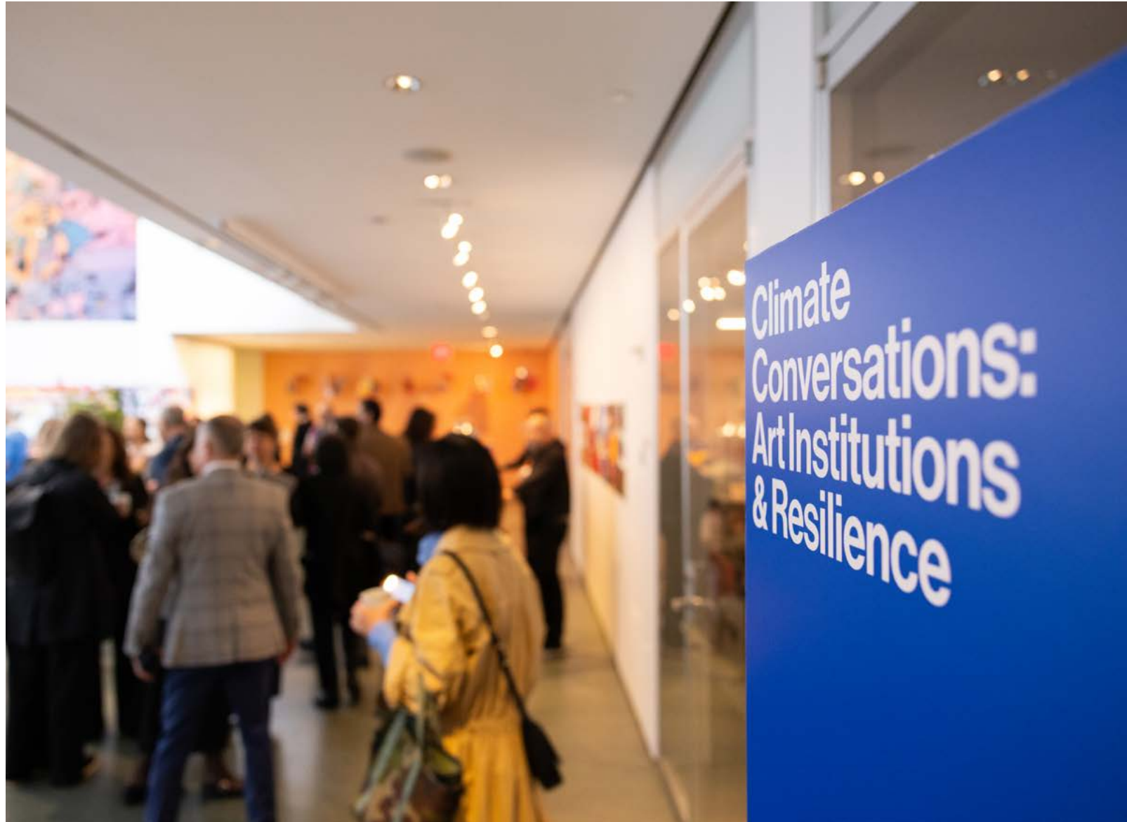
Climate Conversations: Art Institutions & Resilience at MoMA, New York City, May 29, 2025.

Hosted by the Museum of Modern Art and co-organised with and supported by Teiger Foundation and the Helen Frankenthaler Foundation, GCC was proud to bring together more than 150 representatives from across New York's visual art ecosystem for a significant sector event focused on solutions-driven exchange.