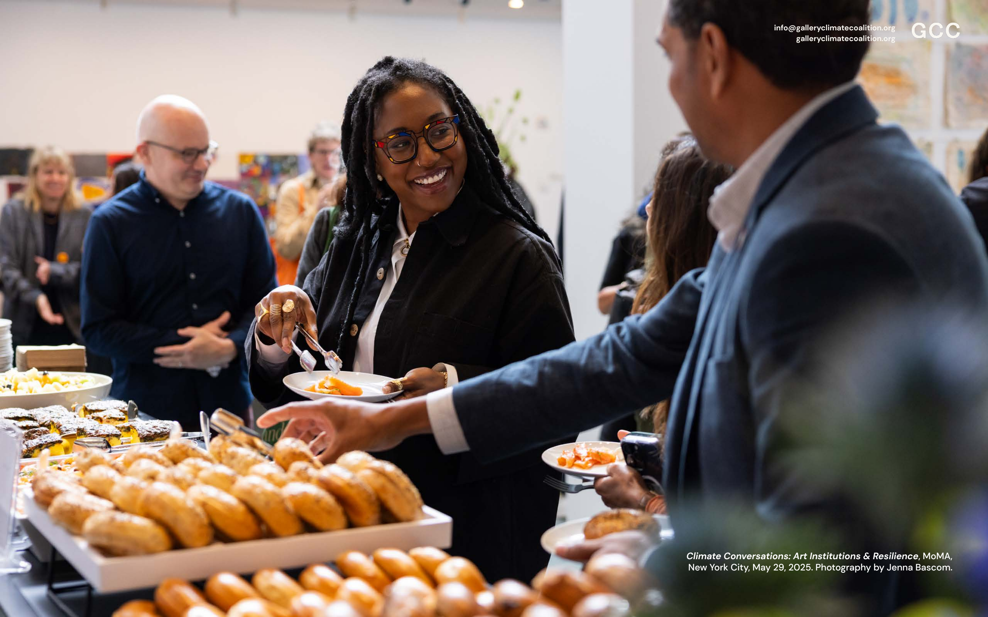
Climate Conversations: Art Institutions & Resilience, MoMA, New York City, May 29, 2025.